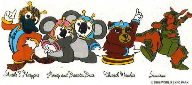
Shudde & Platypus Honey and Boomer Bear Whooosh Wombat Samaras © 1988 WORLD EXPO PARK