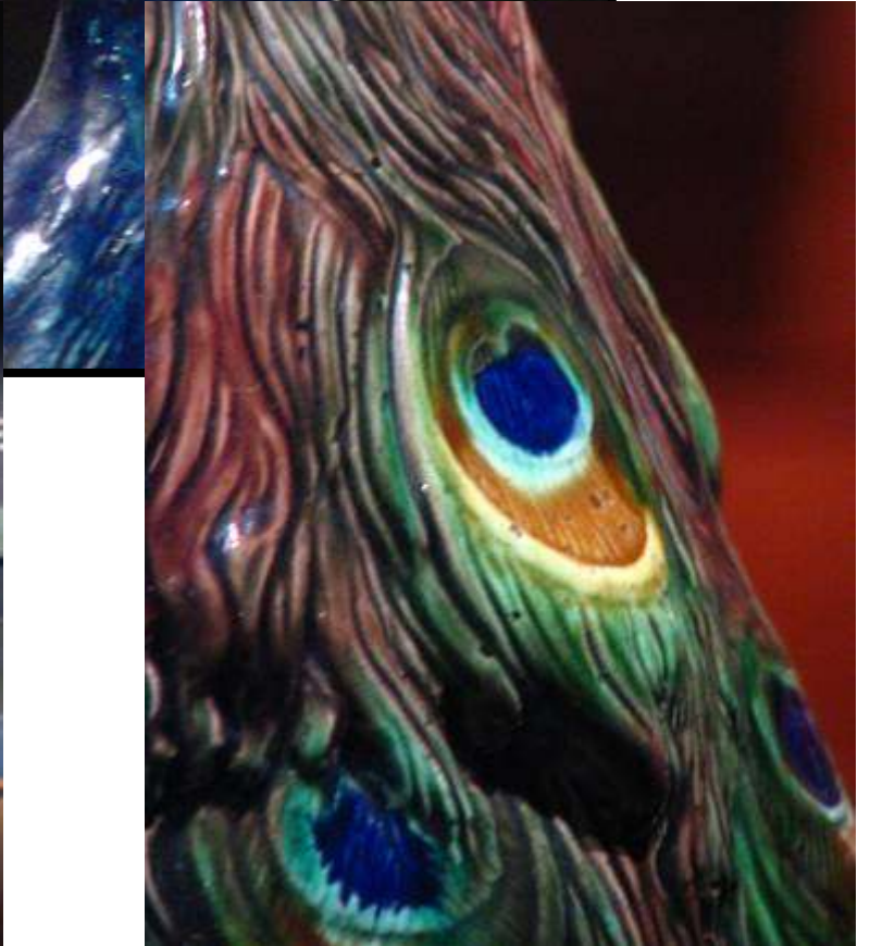
The Loch Ard Peacock was a central feature of the Victoria Pavilion at Brisbane's World Expo '88 – standing in pride of place at the Pavilion's Exterior, in the midst of the Pavilion's blue-rail queue guide – and was viewed and enjoyed by millions of Expo '88 visitors for the six month duration of the Expo - over a century after its planned display at the Melbourne International Exhibition of 1880. It stands today as a symbol across time of beauty, resolve, and determination – and survivor of a great tragedy. May it continue to inspire!