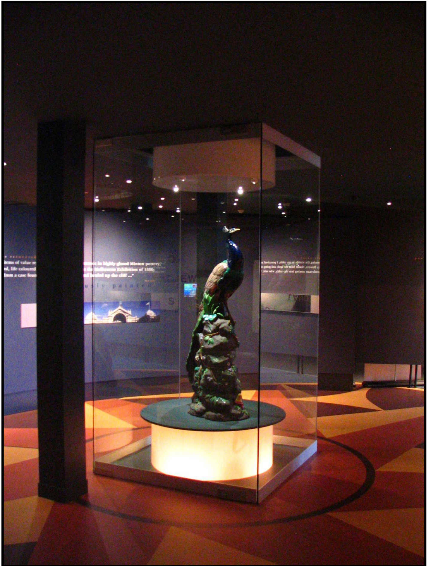
The stunning Loch Ard Peacock in its new home at the Flagstaff Hill Maritime Village, part of a special corner on the Loch Ard disaster, possibly Victoria's greatest shipwreck.