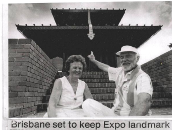
Brisbane set to keep Expo landmark

[A snippet from the Feb 22, 1989 Edition of The Courier-Mail that described the Pitt's role in Saving the Pagoda for Brisbane.]